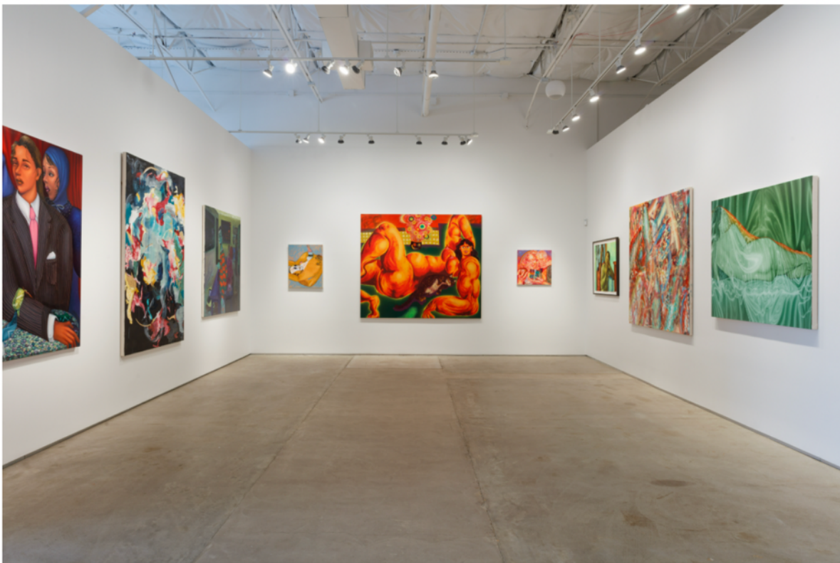
Installation view, The Green Family Art Foundation, 2022

The show is put together under the auspices of the Green Family Art Foundation, a non-profit organization. Founded in 2021, the Foundation wishes to educate the public about the nuances and depth of contemporary art. They present three exhibitions per year, devoted to artists they hope to support for, as they say at their website, “aesthetic, expository and illustrative purposes.” In the exhibition, “Women of Now” the Foundation offers a collection of works whose visual narrative—and many of the pieces do imply stories—demonstrate a strong sense of personal recall, as determined by the location the works describe. While individually very different from each other, the exhibition incisively shows how women are fashioning personal stories about themselves, in a way that frees them as artists from convention. Often, this is done by the generation of visual suggestions that border on a contemporary mythology, in which the artist’s self becomes both a personal assertion and a public display of confidence and fortitude.