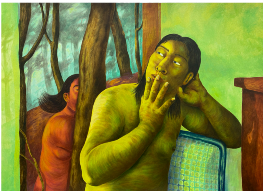
Lily Wong, Into the Thick of It , 2021, Acrylic on paper, 29 1/2 x 41 in.

Lily Wong's Into the Thick of it (2021), painted during the Covid virus quarantine, shows a woman wearing a lime green sweater thoughtfully gazing upward, away from the viewer. Her hands cradle her face and neck. Behind her is another figure, presumably Asian, with dark hair and a reddish yellow skin. Without clothes, the front of the person's body is hidden by a tree trunk. She exists in a forest whose depths reveal more trees and a light blue atmosphere enveloping them. The meditative expression of the first woman's face; the mysterious, half-revealed figure behind her; and the symbolic aspect of the forest all point to a situation in which discomfort reigns, as the painting's title suggests. No one seems to find an escape in the midst of the low-level plague we have endured for three years now.