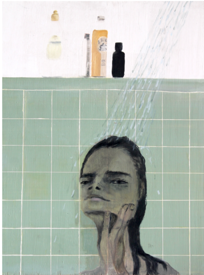
Aubrey Levinthal, Long Shower (Lady), 2020, Oil on panel, 23 1/2 x 18 in.

with green fabric, while the drapes behind her, creased and a darker green, form a background interesting in its own right. We don't know the details of the relations between the women, but the red and yellow line covering the top of Gabriel's head and body is electric with sensuous longing. Sasha Gordon's Interloper (2021) is a self-portrait: a painting of a biracial (Asian and white) woman, whom we are told is involved in a racial and sensual (non-binary) complexity the painting fully details. But the portrait is deliberately unsettling. The artist presents herself beginning just beneath the belly button and then moving up. Her black hair drifts across her face, and her eyes, gazing upward, appear morosely non-expressive. And the title tells us how she feels as someone of a mixed background.