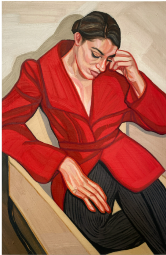
Ania Hobson, Red Jacket, 2020, Oil on canvas, 35 7/8 x 24 in.