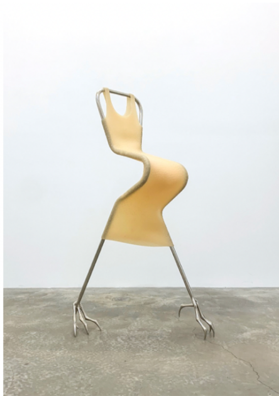
Hannah Levy, Untitled, 2020, Nickel-plated steel, silicone, 44 x 22 x 25 in.